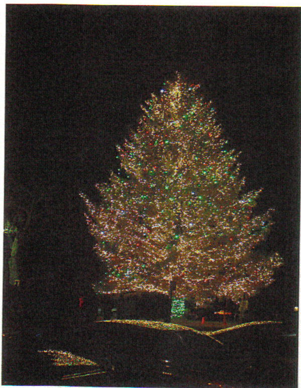
TOWN OF SINCLAIR'S 75' CHRISTMAS TREE IN THE PLAZA